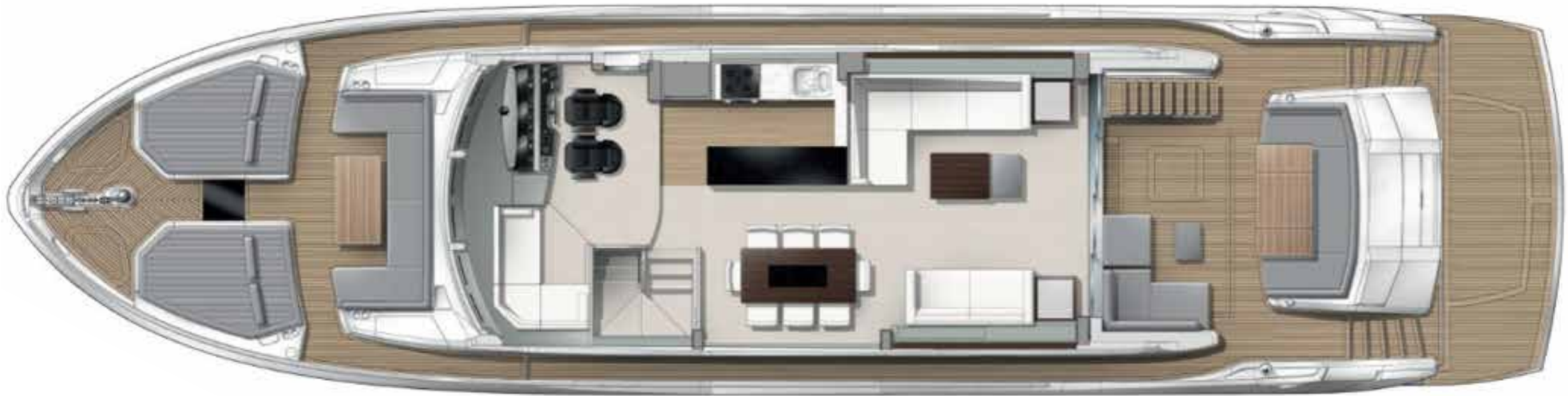
MAIN DECK (STANDARD OPTION) PACKAGE OPTIONS SHOWN